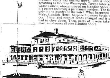
Myles Standish Hotel